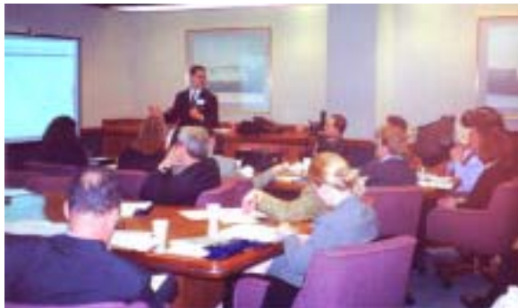
Participants take notes at the February roundtable program about the EU's transition to the Euro, hosted by the KWTC.